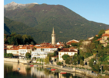
MERGOZZO: THE LAKE AND THE MOUNTAIN MAP OF HIKING TRAILS 1:25.000